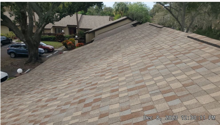
Project: STRATHMORE GATE -2925-2935 BOXWOOD CT / 2310-5007394-01 Date: 12/8/2023, 12:30pm