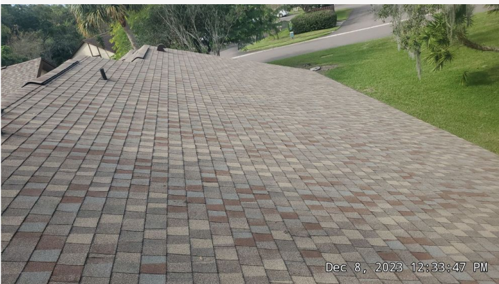
Project: STRATHMORE GATE -2925-2935 BOXWOOD CT / 2310-5007394-01 Date: 12/8/2023, 12:33pm