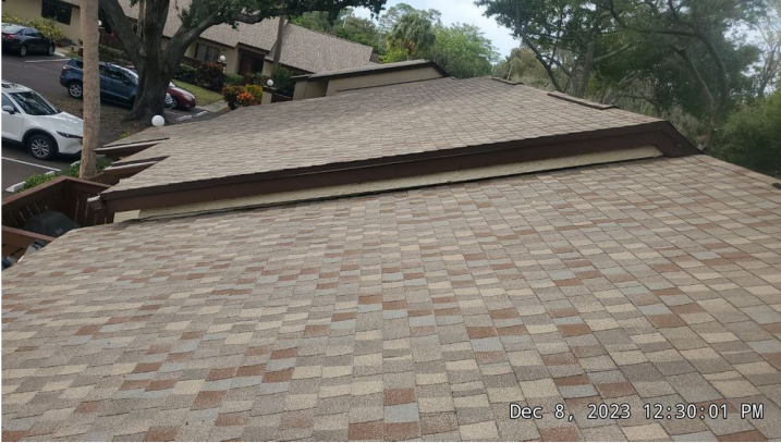
Project: STRATHMORE GATE -2925-2935 BOXWOOD CT / 2310-5007394-01 Date: 12/8/2023, 12:30pm