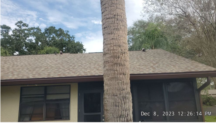
Project: STRATHMORE GATE -2925-2935 BOXWOOD CT / 2310-5007394-01 Date: 12/8/2023, 12:26pm