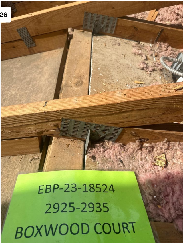
Project: STRATHMORE GATE -2925-2935 BOXWOOD CT / 2310-5007394-01 Date: 12/5/2023, 11:42am